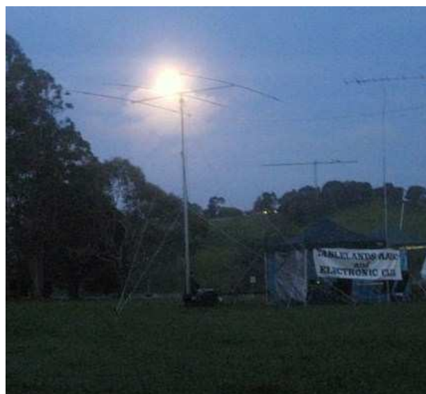
No it's not RF arcing on the Yagi just the perigee moon.