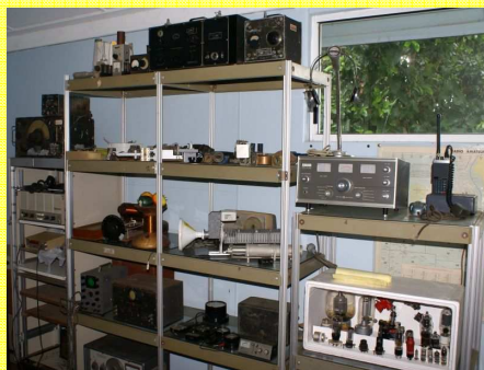
Part of the Historical display at the TREC Clubrooms