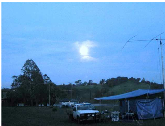
Moonrise over the TREC station VK4WAT