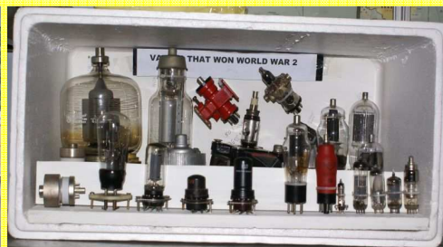
"Valves that won World War 2"