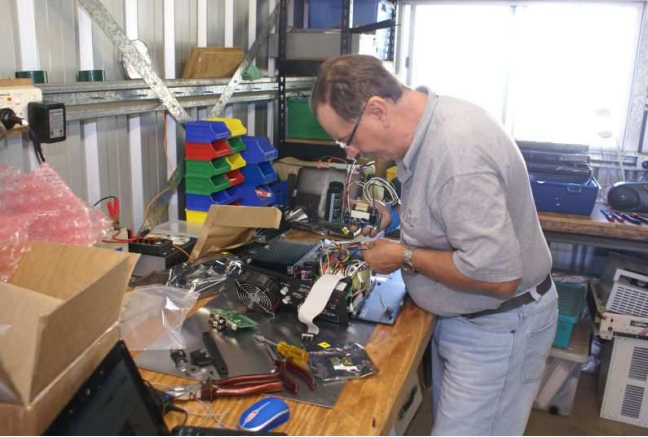
Hmmmm! lots of wires here.