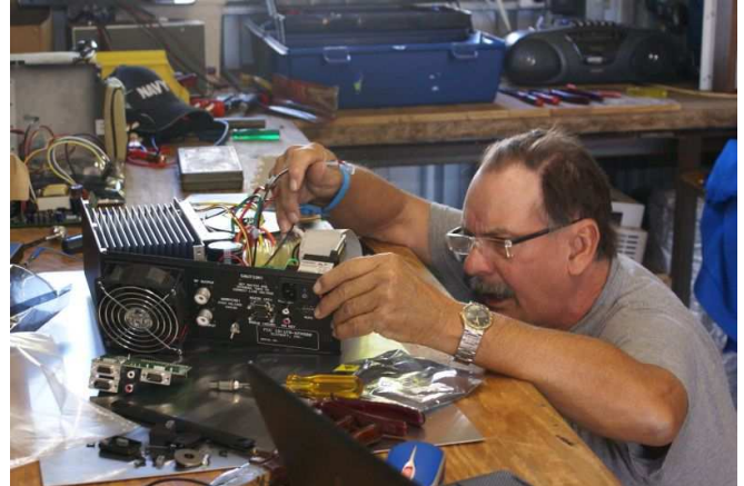
Ahhhh this looks like where it goes.