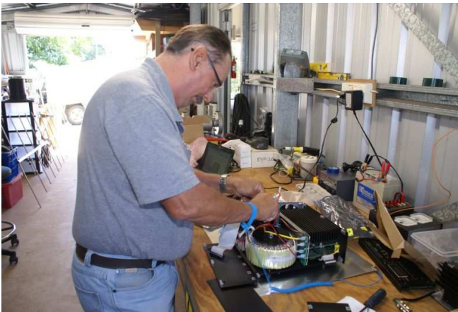
Starting to look good now.