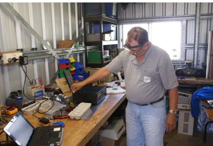
Wow! It all came together.