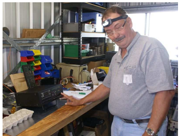
Now for the ultimate test—power on.