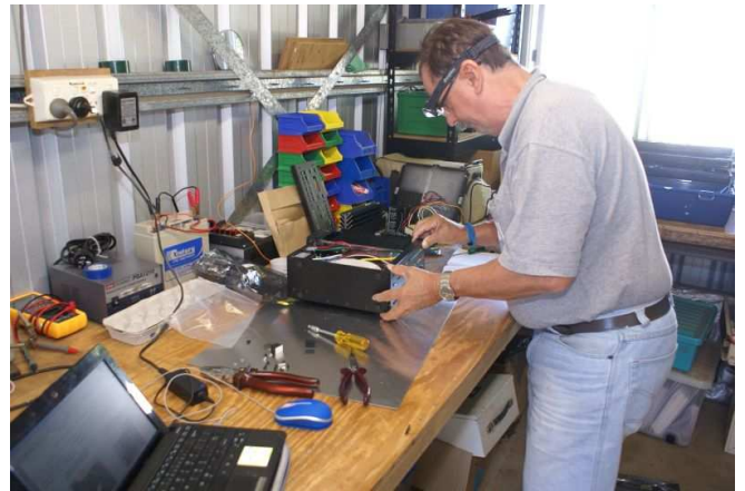
Now for the front panel.