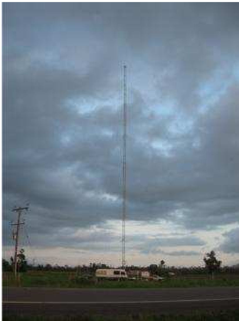
VK4XQA set up at Euramo.