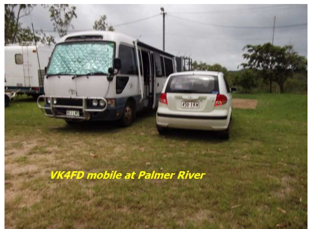
Gary VK4FD toughed it out 210 km to the NW of the Tablelands at the Palmer River Roadhouse where he reported the beer was cold and the weather not all that bad.