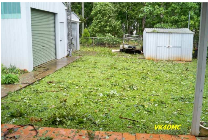
Yard at VK4DMC QTH. All antennas were lowered and fortunately were not damaged unlike TC Larry in 2006. Only trees down and gutters/roof covered with vegetation.