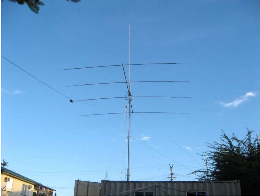
Jeff VK4BOF's replacement antennas. 4 el Tet-Emtron tribander TE43 with a dipole mounted below. Note the rotatable vertical on the top.