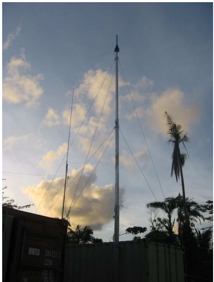
The tower fully erected, before the yagi was mounted, showing guying Full extended height approximately 11M.