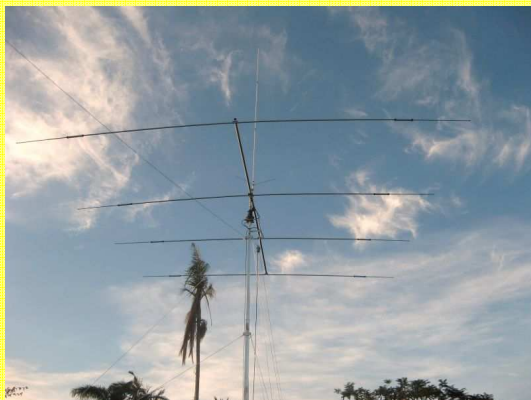
Jeff VK4BOF's new 4 el Tet Emtron tribander TE43