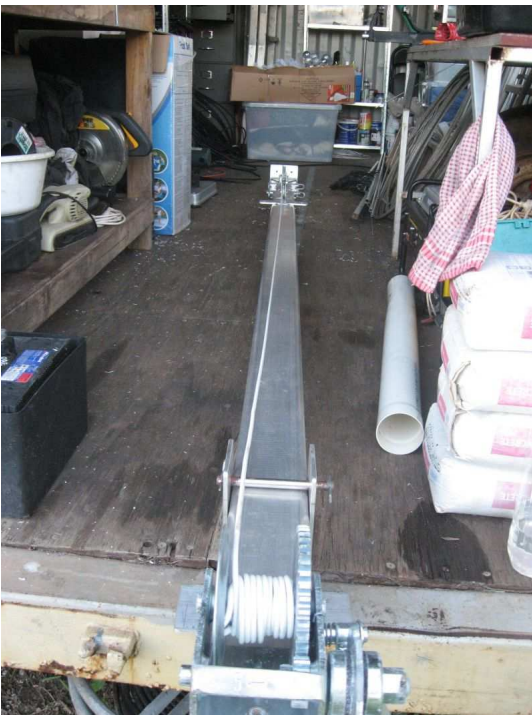
The tower was designed and fabricated by Gary VK4FD.